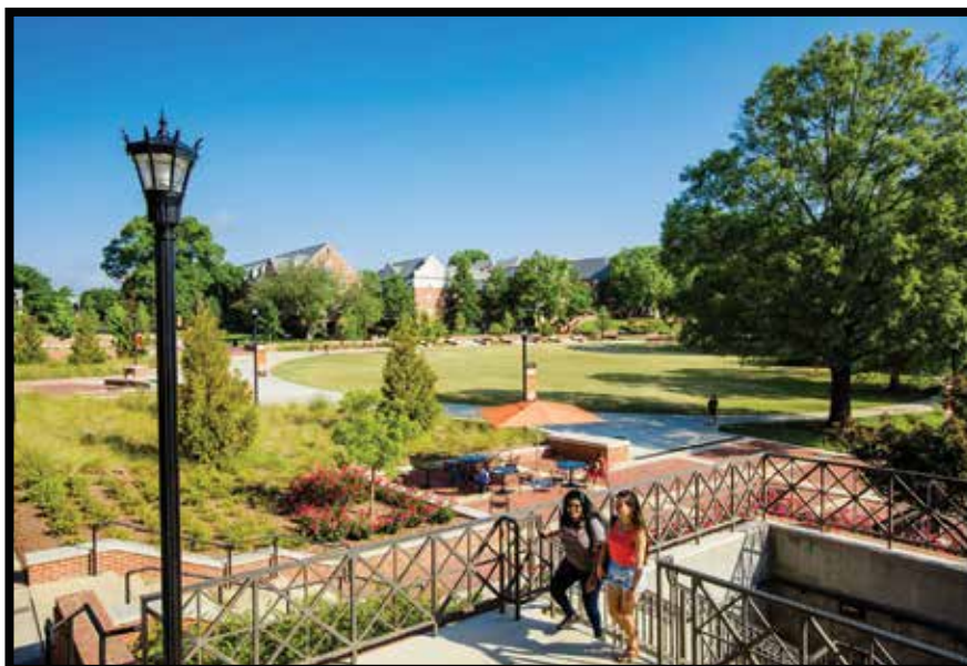
Mercer University, Cruz Plaza; HGOR